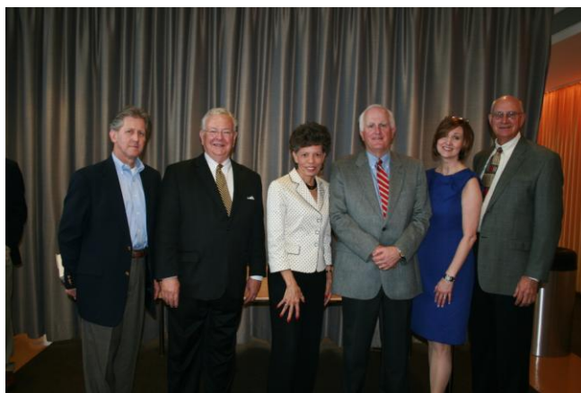
Board members enjoy the special reception to benefit the William E. Foley Research Fellowship.

For more information on the activities of the Friends of the Missouri State Archives, please call (573) 526-1981.