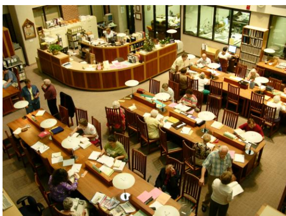
Patrons visiting the Archives conduct their research in the Alex M. Petrovic Reading Room, which is also a stop on Archives tours.

Even with all of these activities, Archives Alive! , a free history-based theatrical performance for school children, remains the most popular outreach program supported by the Friends. The interactive performance brings Missouri history to life for fourth and fifth grade students from across the state. The program's sixth season included twenty-four performances from March to May 2010 and was attended by 4,802 children. Among other things, students participating in Archives Alive! learn about the founding of Missouri, the lives of explorers and immigrants in the region, Missouri's role as a border state in the Civil War, and the lives of famous Missourians, such as Harry Truman and Jesse James. This year's season was co-sponsored by Hawthorn Bank, the Missouri Arts Council, and the A. J. Schwartze Community Foundation, with additional funding provided by the Eldon Chapter of the Daughters of the American Revolution.