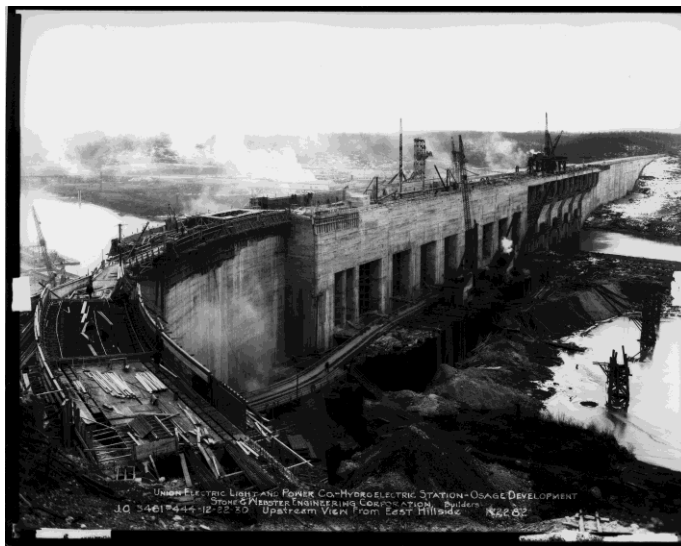
Upstream View from East Hillside, 1930 – One of many photographs now available online from the Bagnell Dam Construction Photographs collection