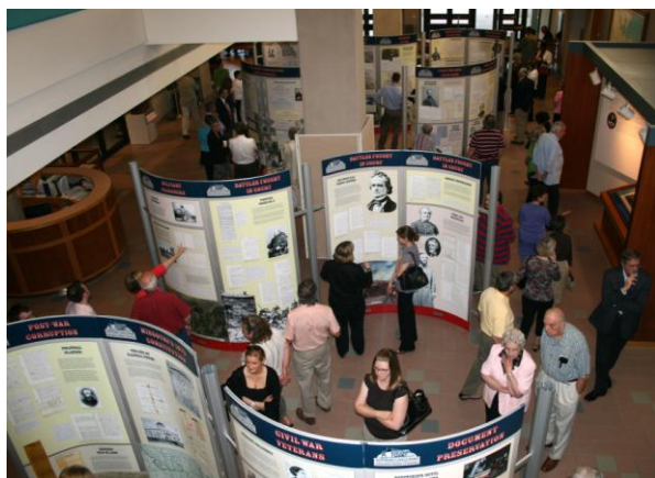
Divided Loyalties: Civil War Documents from the Missouri State Archives opened in April 2010.

Live recordings of many of these public programs are available at www.sos.mo.gov/archives/about/presentations.asp . This website is used to make educational programs available to audiences outside Jefferson City and includes numerous videos of interest to genealogists and historians.