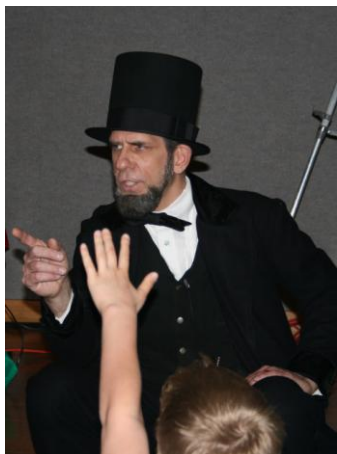
Abraham Lincoln travels through time to teach students about the sesquicentennial of the Civil War in Civil War Archives Alive! .

Another resource made available during the past year is a web-based version of the exhibit unveiled in April 2010, Divided Loyalties: Civil War Documents from the Missouri State Archives . All thirty-five panels from the exhibit are included in a navigable PDF format, complete with detailed audio narration. Users of the online exhibit are able to stop, rewind, and fast forward. In addition, the entire thirty-two minute audio tour can be downloaded to a personal media device. To view the online version of Divided Loyalties , created with the assistance of the Wolfner Library for the Blind and Physically Handicapped, please visit www.sos.mo.gov/mdh/CivilWar/DividedLoyalties.asp .