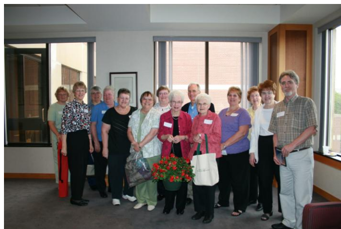
Some of the guests at the volunteer reception show off the door prizes donated by the Friends.

Many of these tours are provided through a docent program supported by the Friends. This program enables Archives' staff to devote more of their time to responding to research requests and making historical records available to the public. This year, the Friends sponsored a reception during National Volunteer Month to honor the docents and other Archives volunteers. In addition to providing tours, volunteers at the Archives process records on-site, participate in computer-based transcription projects from home, and prepare county documents for preservation microfilming in communities throughout the state.