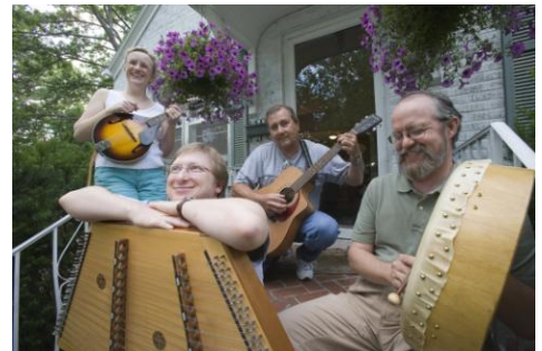
This year's most popular program was the River Ridge String Band's live performance.