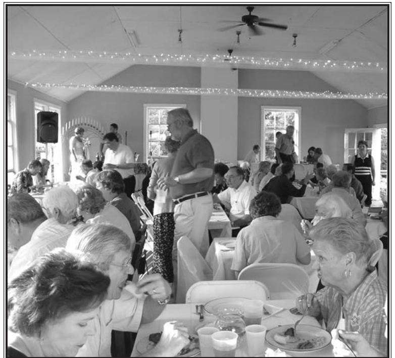
After the Friends annual meeting, attendees settle in for dinner and a performance by the Boogie Woogie Babes at the Zion Historic Chapel.