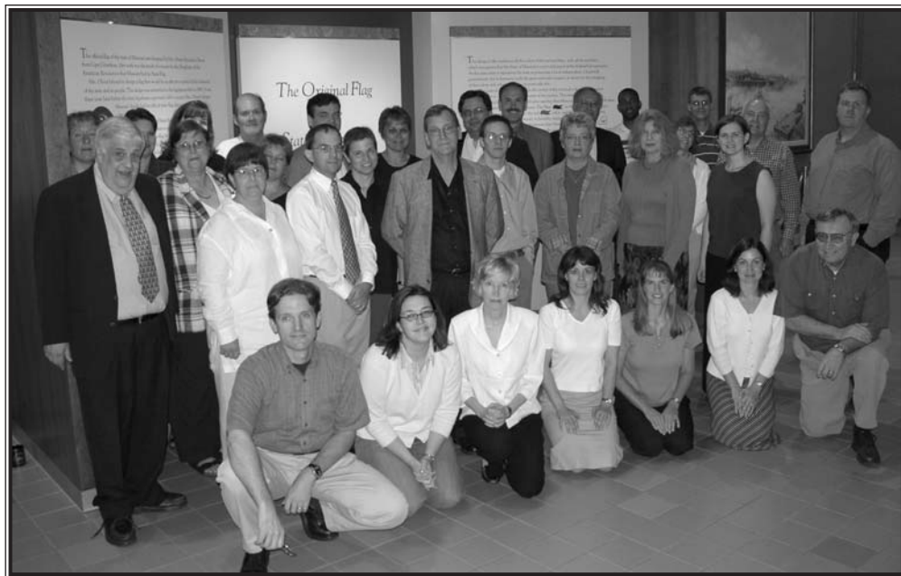
Archives and Local Records staff pose with visiting scholars during a break in their conference.