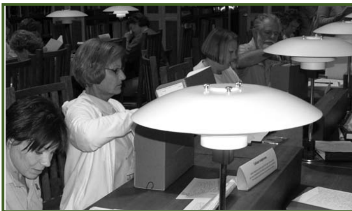
Educators from Chillicothe add depth to their knowledge of American History through research and study at the Missouri State Archives.

Missouri students can look forward to being the beneficiaries of their teachers’ increased knowledge levels and research skills developed through these Teaching American History grant projects.