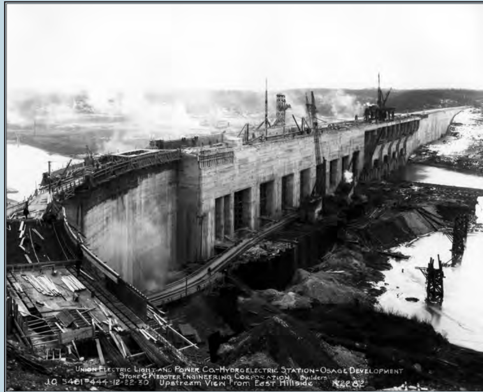
Bagnell Dam —upstream view from east hillside — December 1930