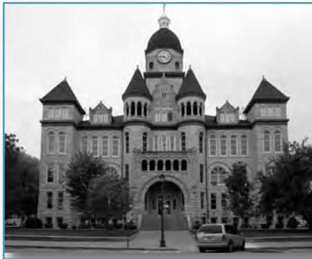
Jasper County Courthouse

From the earliest log structures to the 19 courthouses constructed in Missouri under the Public Works Administration (1934–1941), to the current trend of building annexes that save the courthouse proper for