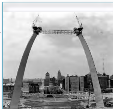
Gateway Arch construction — July 8, 1965

the pioneers to the monument's design, completion and symbolism. The documentary places the