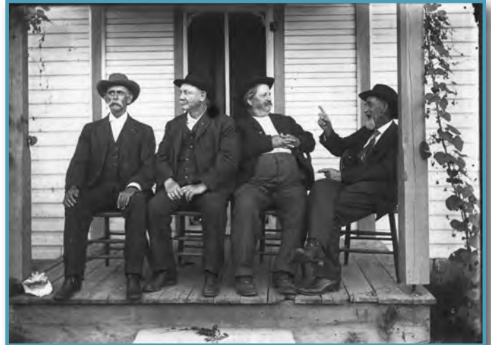
Four Men on a Porch