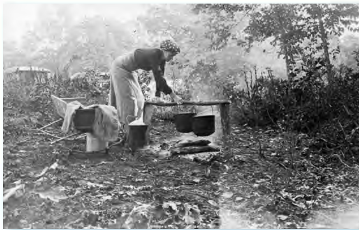
Woman making soap — circa 1915